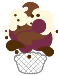
BLACK FOREST GATEAU v/gf in pot Chocolate, cherry, whipped cream & choc shavings