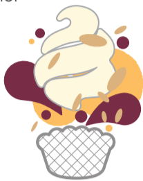
CHERRY PIE v/n Vanilla, cherry, frangipane & toasted almonds