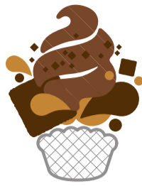
MUD PIE v/n Chocolate, brownie & salted caramel