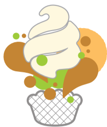
APPLE PIE v/n Vanilla, apple, salted caramel & frangipane