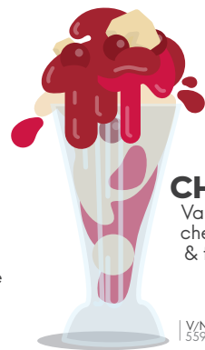
CHERRY PIE Vanilla ice cream, cherry, shortbread & flaked almonds