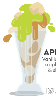
APPLE PIE Vanilla ice cream, apple, caramel & shortbread