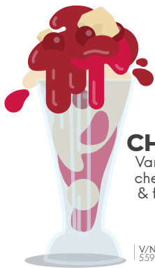
CHERRY PIE Vanilla ice cream, cherry, shortbread & flaked almonds