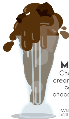
MUD PIE Chocolate ice cream, chocolate, caramel & chocolate brownie