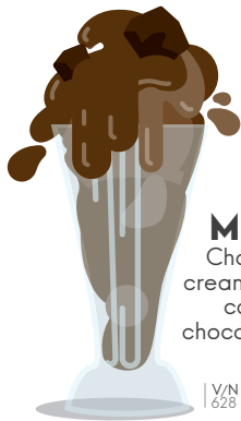
MUD PIE Chocolate ice cream, chocolate, caramel & chocolate brownie