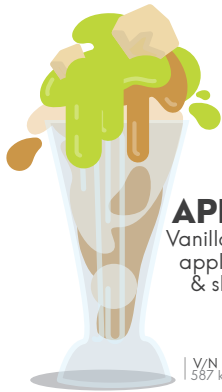
APPLE PIE Vanilla ice cream, apple, caramel & shortbread